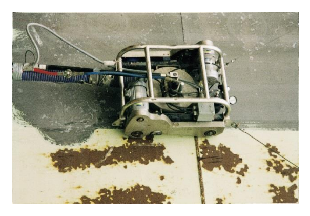
Figure 4. Ultra-high pressure water jetting of steel barrier gates.