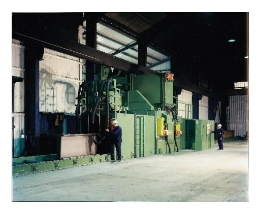
Figure 1. Automatic shot blast plant.

By far the most significant and important method used for the thorough cleaning of mill-scaled and rusted surfaces is abrasive blast cleaning. This method involves mechanical cleaning by the continuous impact of abrasive particles at high velocities on to the steel surface either in a jet stream of compressed air or by centrifugal impellers. The latter method requires large stationary equipment fitted with radial bladed wheels onto which the abrasive is fed. As the wheels revolve at high speed, the abrasive is thrown onto the steel surface, the force of impact being determined by the size of the wheels and their radial velocity. Modern facilities of this type use several wheels, typically 4 to 8, configured to treat all the surfaces of the steel being cleaned. The abrasives are recycled with separator screens to remove fine particles. This process can be 100% efficient in the removal of mill scale and rust.